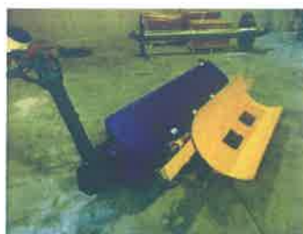
Cloth Roll Carrier