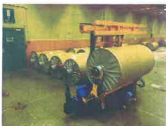
Warp Beam Carrier

The AG Group currently offers almost all types of electric trolleys for weaving room. Now instead of manufacturing these trolleys in Italy, they will use Rabatex facilities to manufacture all the equipment in India, maintaining the quality and production standards of AG Group.