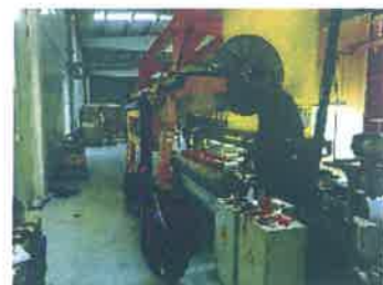
Top Beam Carrier

ALEXANDER & GIOVANNELLI GROUP S.R.L.S. Via Jucker, 51 20025 LEGNANO (MI) Italy C.F. - P. IVA 10388350968